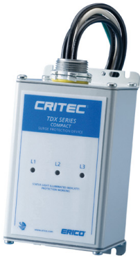
Compact TDX Panel Protector, 50 kA