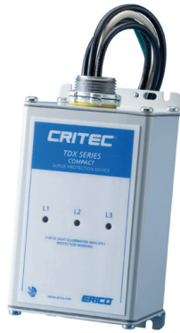
Compact TDX Panel Protector, 100 kA