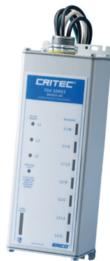
Modular TDX Panel Protector, 100 kA with Surge Counter