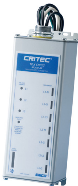
Modular TDX Panel Protector, 100 kA