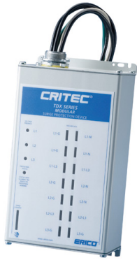
Modular TDX Panel Protector, 200 kA with Surge Counter