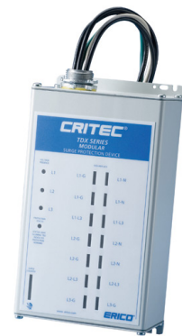
Modular TDX Panel Protector, 200 kA