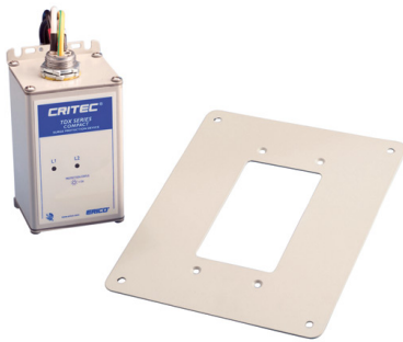
Transient Discriminating Panel Protector Accessories

NEMA is a registered service mark of National Electrical Manufacturers Association. UL, UR, cUL, cUR, cULus and cURus are registered certification marks of UL LLC.