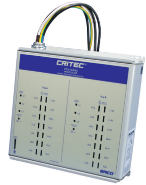
Modular TDX Panel Protector, 400 kA