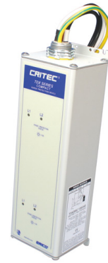
Compact TDX Panel Protector, 200 kA