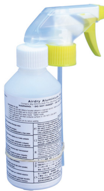
Aluminum Welding Flux