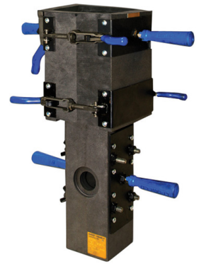
Industrial Frame Assembly