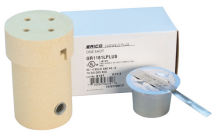
nVent ERICO Cadweld One Shot, Cable to Cable

The nVent ERICO Cadweld One Shot is a convenient, single-use ceramic mold and welding material connection package. The nVent ERICO Cadweld One Shot is ideal for making permanent reliable connections to ground rods for electrical transmission and distribution, telecommunications, and cable television applications.