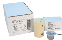
nVent ERICO Cadweld One Shot, Cable to Ground Rod

Cadweld ceramic single-use mold designed and engineered to create cable to ground rod exothermically welded connections.