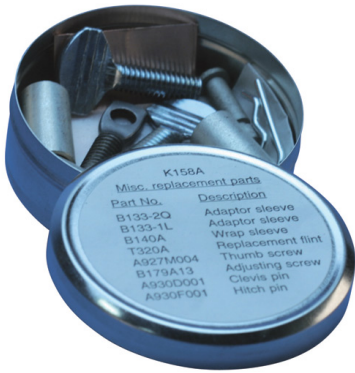
nVent ERICO Cadweld Replacement Part Kit