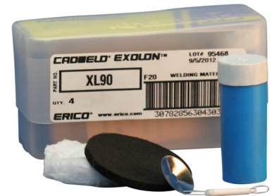
nVent ERICO Cadweld Exolon Welding Material, F20