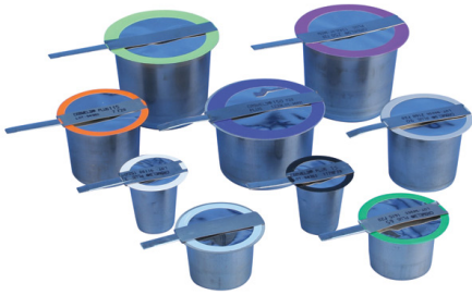
nVent ERICO Cadweld Plus Welding Material, F20