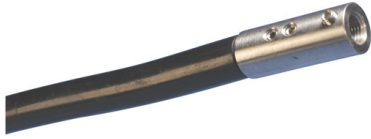
Terminated Isolation Conductor