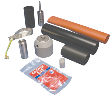
ISODC Termination Kit