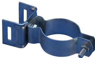
ISODC Mast Bracket