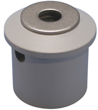
68 Fiberglass Mast Cap