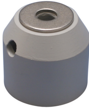
50 Fiberglass Mast Cap